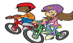
This week's attendance...

Please ensure that scooters and bikes are not used within the school grounds. It is not safe and we have many very young children who could be hurt.